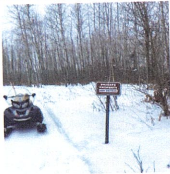
Nks and Roads